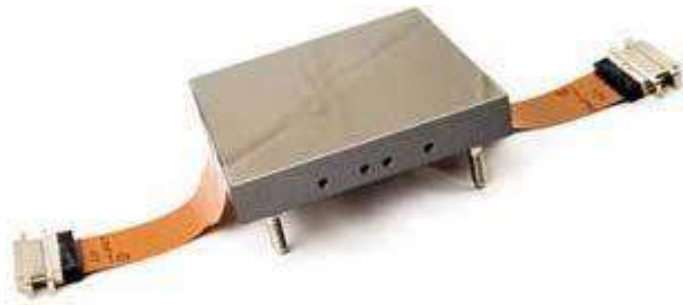
Fig1: 6k x 6k CCD, SiC buttable package with Flexi connector (pictorial representation)

This document outlines the specifications and requirements for the procurement of CCD Detector Controller Electronics. The electronics must be specifically designed to control a 6k x 6k CCD array specifically CCD-231-C6