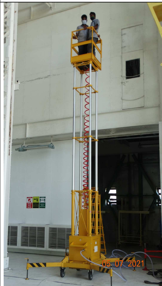
Single mast type Aero lift in raised and stowed condition (reference purpose only)