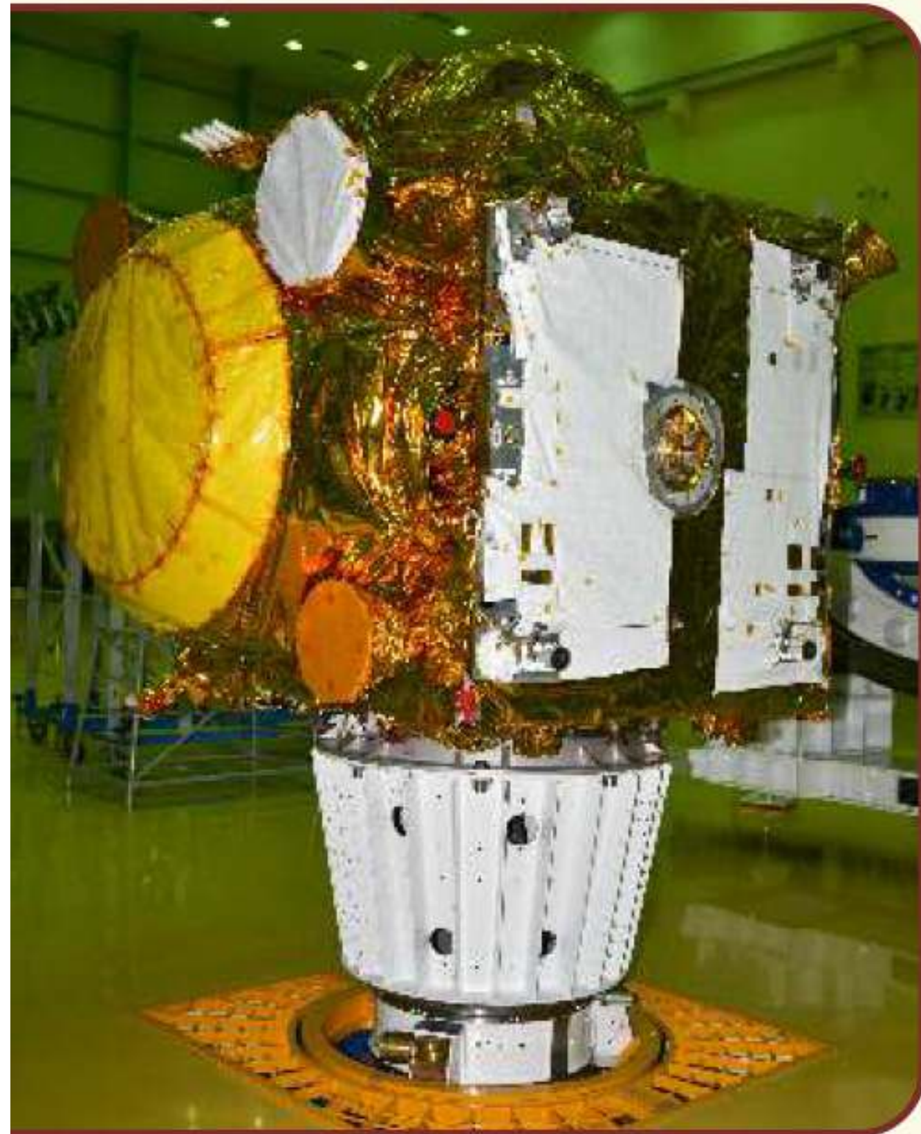
IRNSS-1I during a prelaunch test