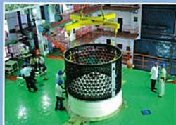
IS 1/2 V assembly