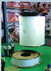
GS1 Segment assembly