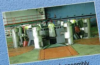
Support Block assembly