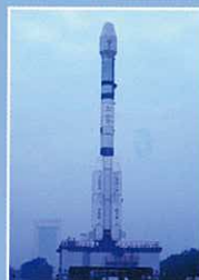
Vehicle movement to UT