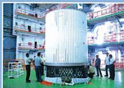
IS 1/2 M assembly