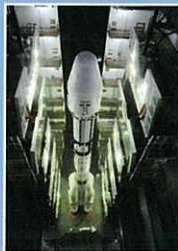
Vehicle at VAB