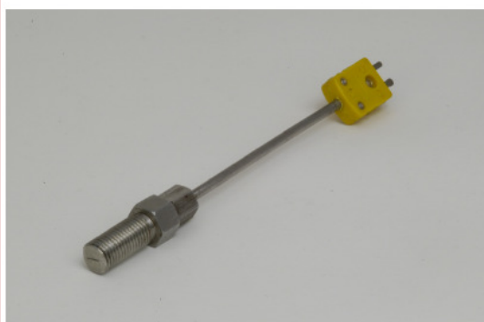
Fast Response Temperature probe