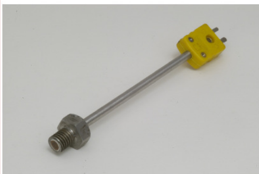
Slug heat flux sensor