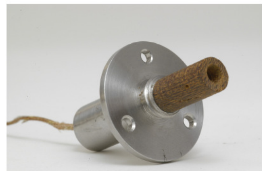
Stagnation Temperature probe