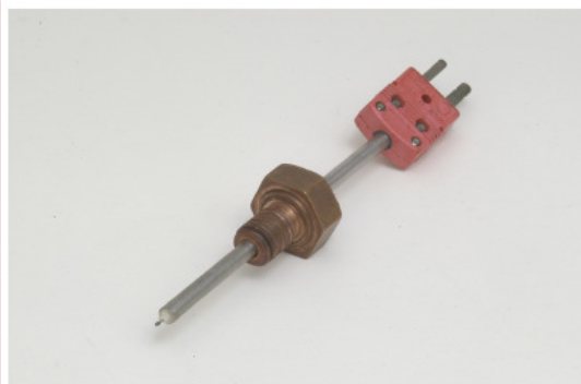
Gas Temperature probe