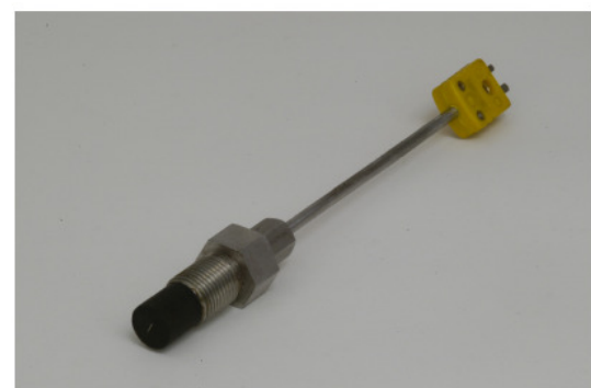
Eroding Temperature probe