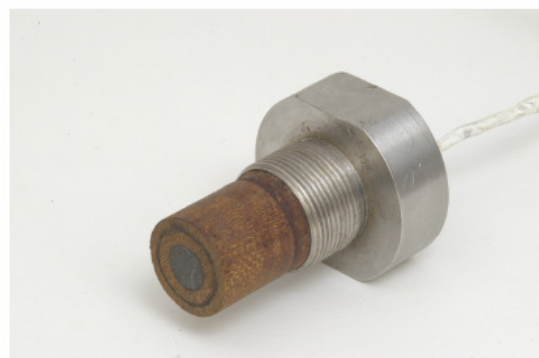
Graphite heat flux sensor